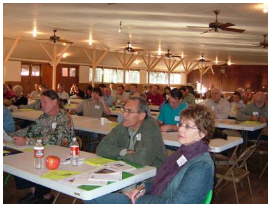
Participants at the Land Resources Seminar.

from Cibolo to be a participant. Twelve presenters spoke on a variety of topics including